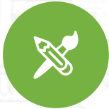
Web & Graphic Design

5Boro Digital provides services tailored to your marketing needs, whether you require support for your in-house marketing team or you need to outsource all of your marketing activities.