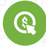
PPC Pay Per Click